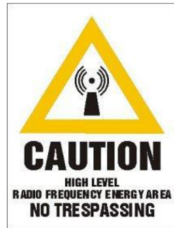
Figure 1: RF-EMF Warning